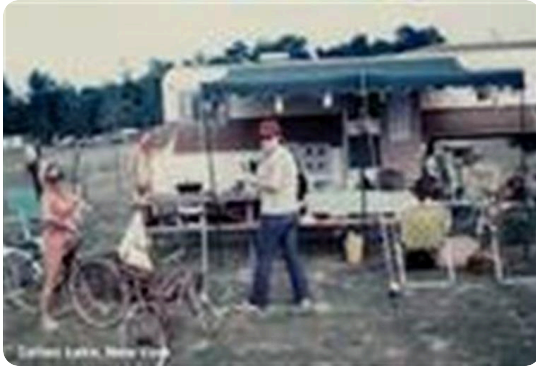
Camping At Darien Lake