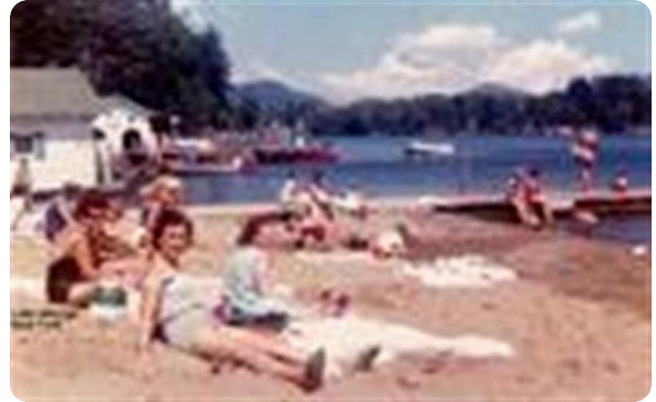
Vacations at Lake George